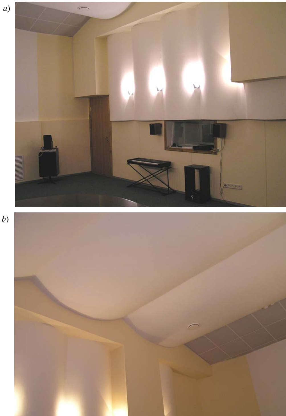
Fig. 1. Acoustic design of surfaces of studio: a) the form of walls; b) the form of ceiling

In equipment room as optimum value of time of reverberation 0,3 sec. with in all range of frequencies 125 – 4000 Hz was accepted. For this purpose have been applied the low-frequency resonant absorbers (50% from the area of walls), the punched plaster plates, ceiling sound-proof panels "Eco-phon" (50% from the area of a ceiling), carpet to a covering of a floor.