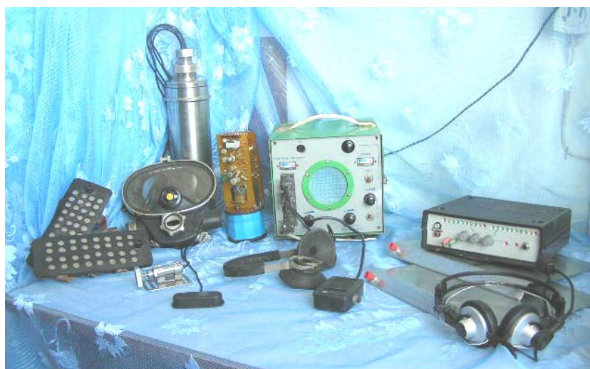
Fig. 2. Underwater voiced device for communication of divers.

The system of underwater radio-telephone communication intended for simplex link between the divers and operating ship, where the principle of electrical current field modulation is involved, consists of two half-sets. Underwater station includes in itself electronic module with seeding in box, microphone mounted in mask and the headphones of done conductivity (sink of car is opened for breath) as well the electrodes of dipole antenna that must be placed on shank and wrist of a diver. Above-water station has 30 m long antenna that can be longer depending on chosen distance of links. Modulation takes place in 300-5000 Hz band of sound frequency. Range of communications is 70-80 m (in the mode of "diver to diver") in the shallow water (till 20 m depth) it is equal to more than 100 m. The linkage distance between the shore (ship) and a diver is more then 150 m. The constituent parts of device for voiced communication are assembled as depicted in fig. 2.